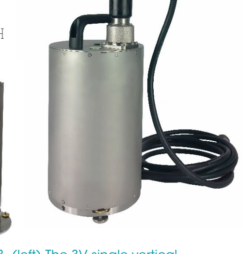
Figure 3. (left) The 3V single vertical component sensor and (right) the 3T-120 posthole seismometers.

Due to the proximity of the HNAR array to the coast, the project team selected the Güralp 3T-120 PH (posthole) seismometer as it was suitable for sub-surface installation.