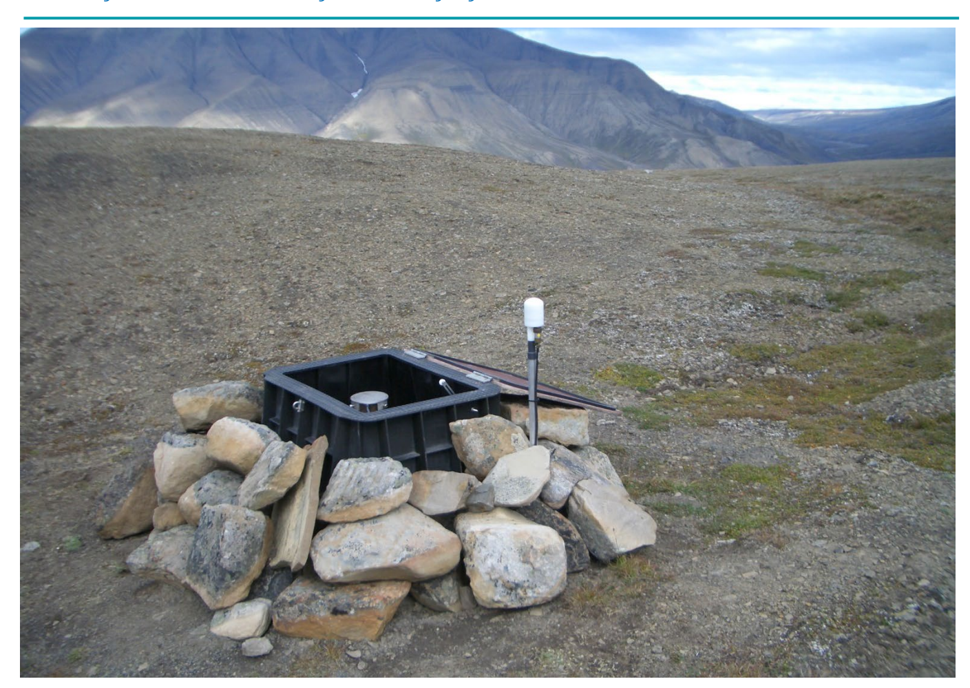
Figure 1. Installation at Spitsbergen in 2004 (SPITS array)

Güralp instrumentation selected for NORSAR arrays for nearly thirty years.