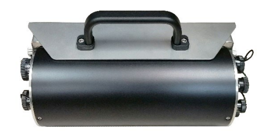
Figure 5. Affintiy digitiser

The Affinity delivers high-quality digitisation with 31-bit resolution. Designed for data quality and durability, the Affinity is a stable and robust Linux-powered unit with onboard storage and networking facilities.