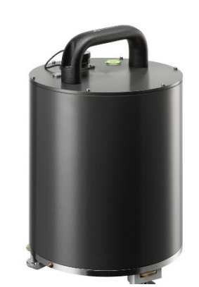
Figure 4. 3ESPC seismometer

Ideally suited for long-term temporary and permanent installations in areas with low to moderate noise levels. The instruments' broadband response and low self-noise level make it suitable for seismic monitoring at all scales: local, regional and teleseismic.